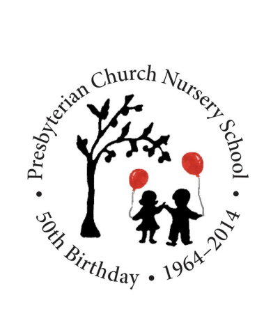
Pajama Day at PCNS

As we reach the end of another school year, The Presbyterian Church Nursery School (PCNS) is grateful for another successful year helping children to grow and learn. At this time, we always want to express our thanks to the Presbyterian Church of Morristown's staff and church members for supporting the school and complying with COVID safety rules to allow the school to stay safe. All PCNS staff once again went above and beyond to provide a wonderful educational experience for our students.