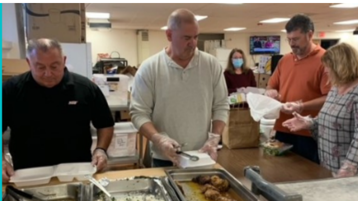
Table of Hope was founded by members of the Bethel Church of Morristown and has been supported by PCM since September 2013. After Hurricane Irene flooded the church, community members, and a donor, rebuilt the fellowship hall and a new commercial kitchen. This generosity spurred members of Bethel Church to do more for the community, thus Table of Hope was born. Now a trusted community soup kitchen, they serve dinner five nights a week to anyone in need of a warm meal and a smile.

Every week Table of Hope serves hundreds of hot meals-to-go from their soup kitchen and distributes groceries to thousands of local families at their food pantries. In 2021, they served over 18,500 soup kitchen meals and provided groceries to over 39,000 families in Morris County.